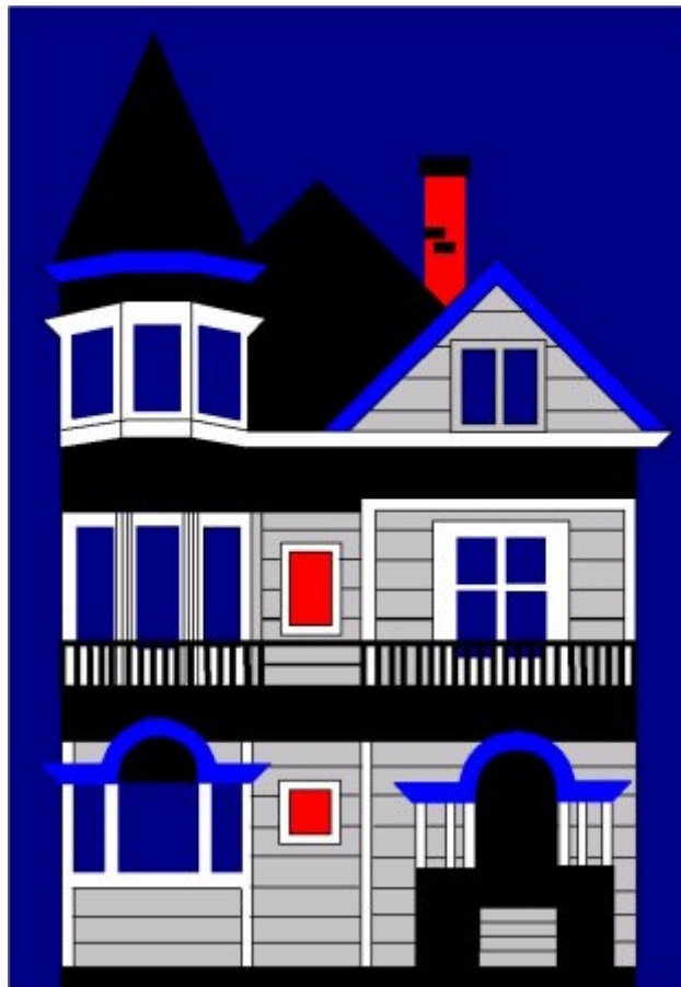
"1080 Haight Street"

use this Colorful Simplicity image by Asbjorn Lonvig